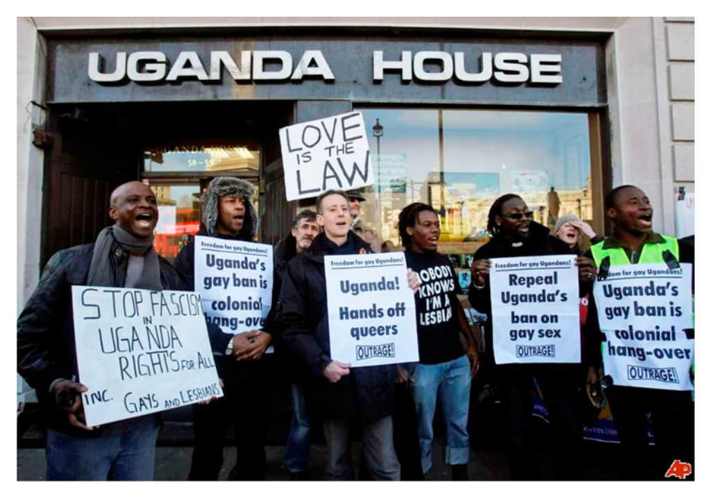
Figure 2. Protesting in London against anti-gay legislation in Uganda, 10 December 2012.