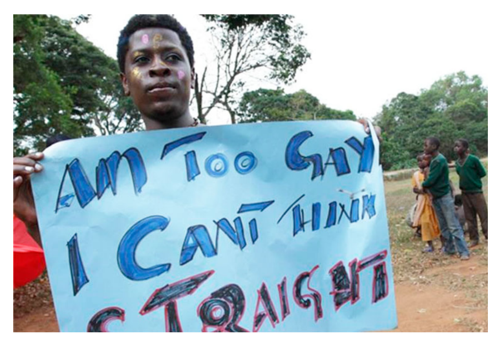
Figure 1. Gay and lesbian activists attend Uganda's first gay pride parade in Kampala, Uganda, in 2012.